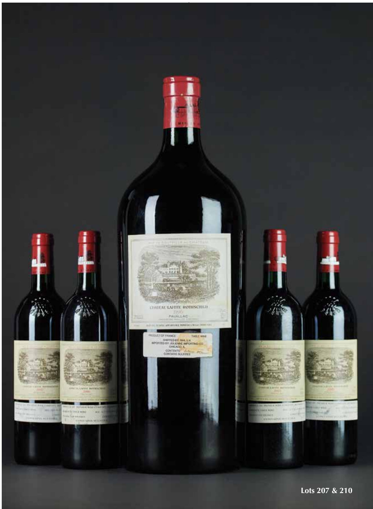
Lots 207 & 210