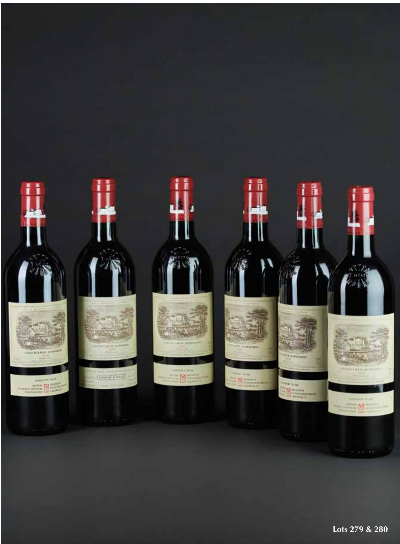
Lots 279 & 280