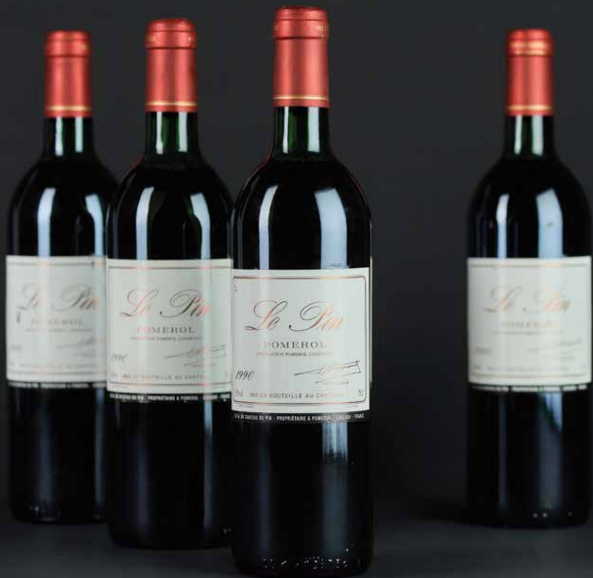
Lots 443 &444