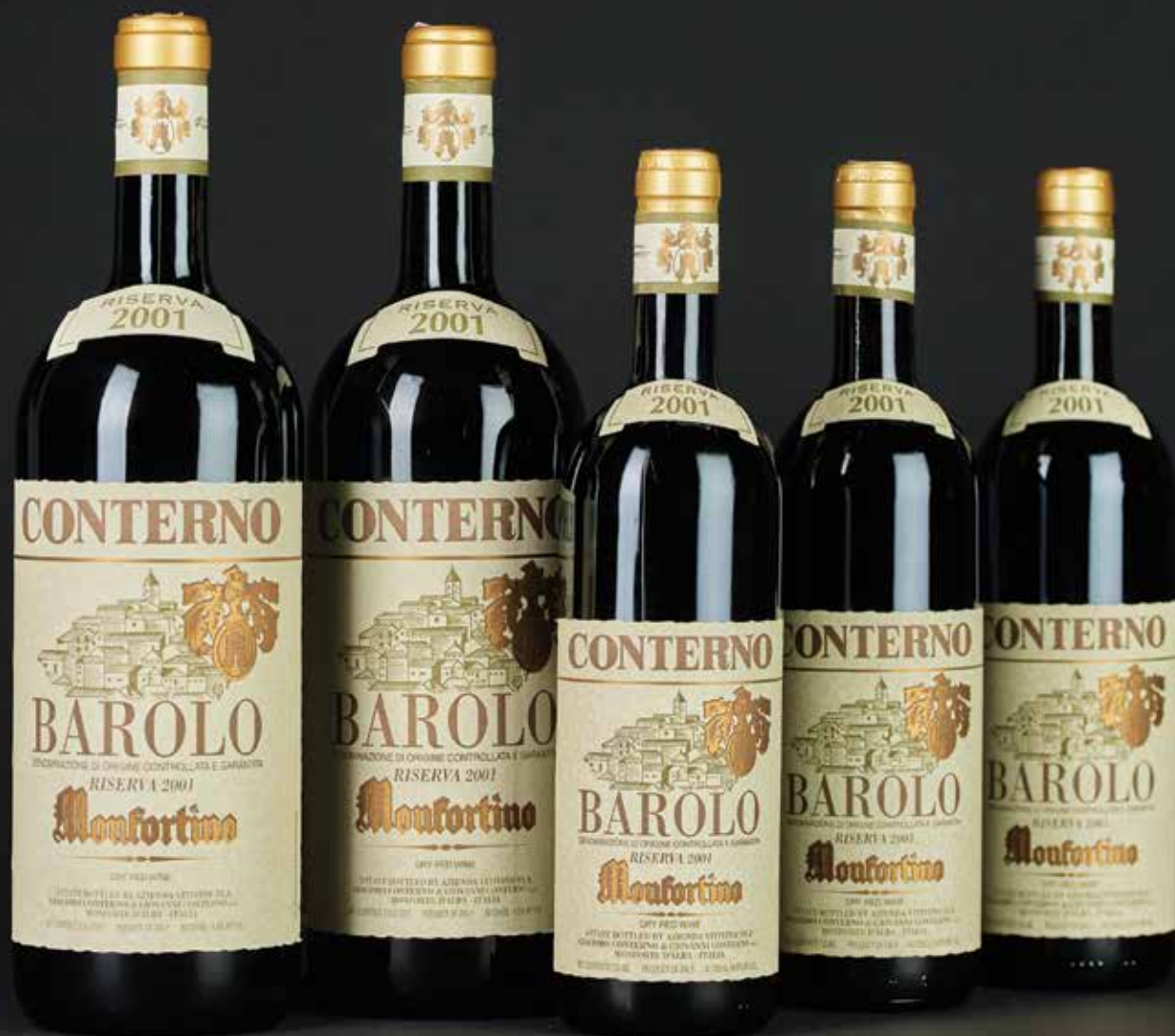
Lots 86 & 87