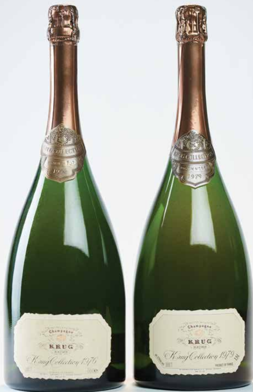
Lots 365 & 366

Looking for some Krug or Cristal? Don't worry, it's here! As well as many other examples of the finest examples of white Burgundy tomorrow, so don't miss out on any of these lots.