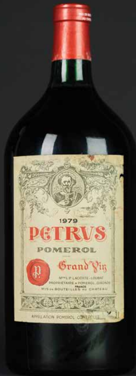
Lots 447 & 448