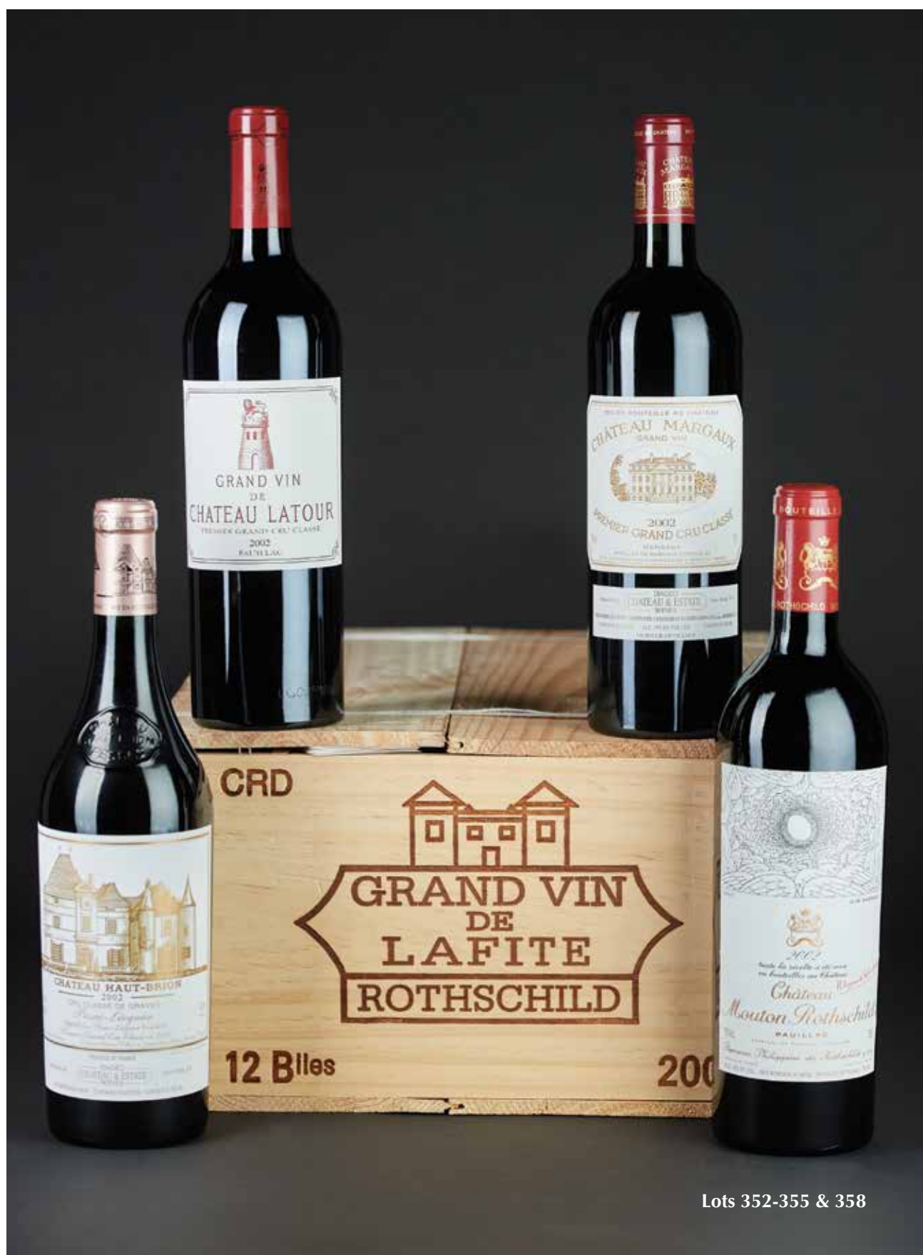
Lots 352-355 & 358