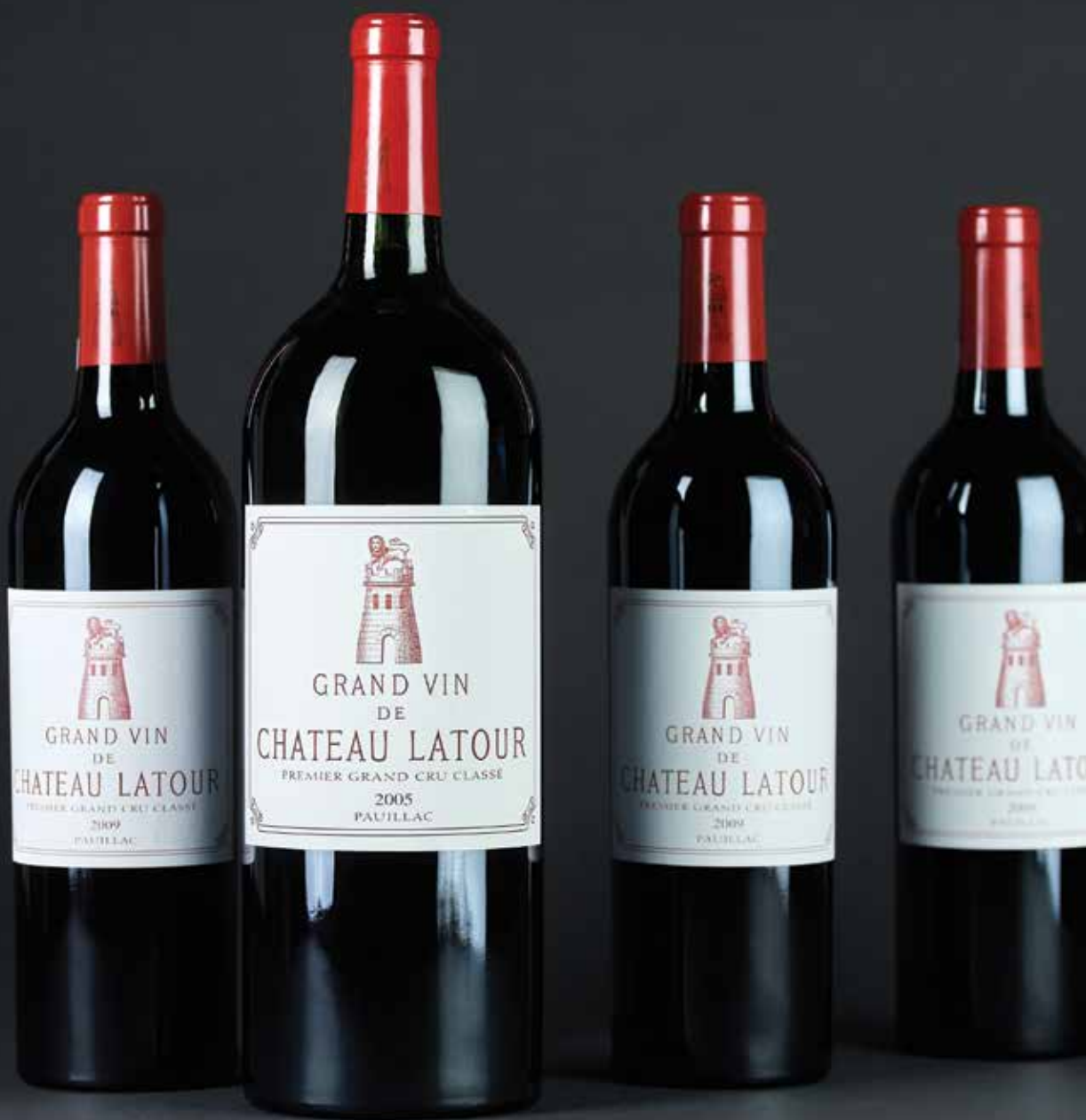
Lots 283 & 284