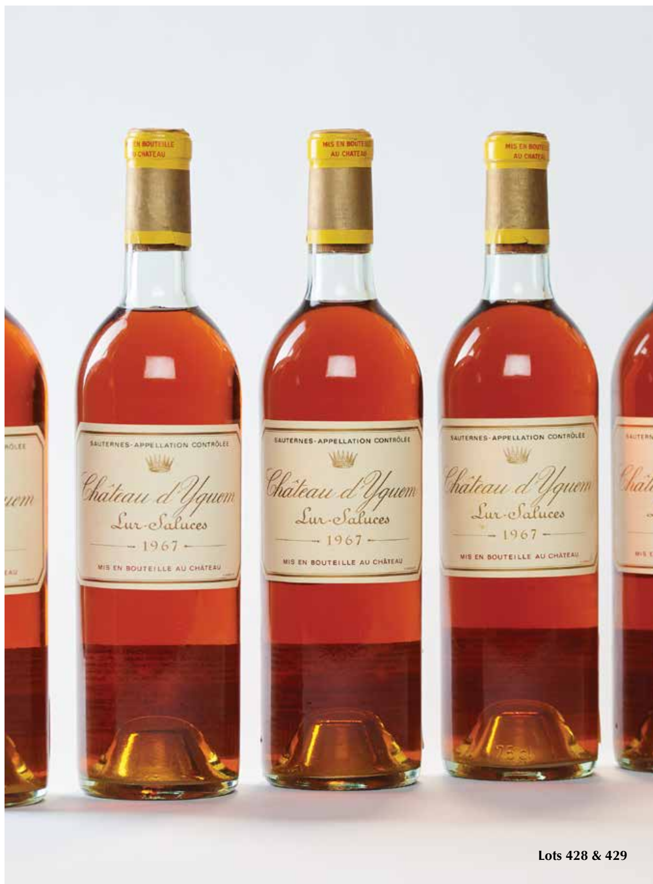
Lots 428 & 429