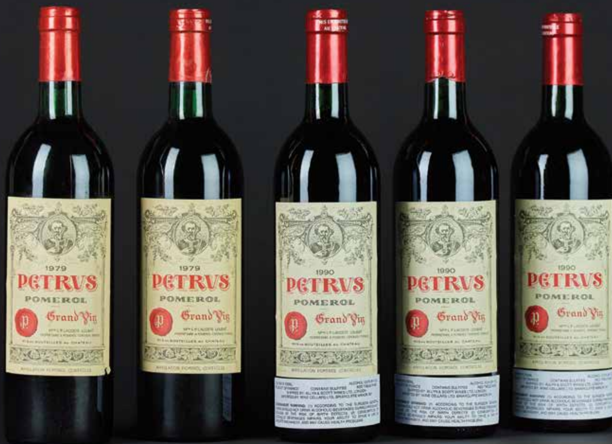
Lots 449 & 451