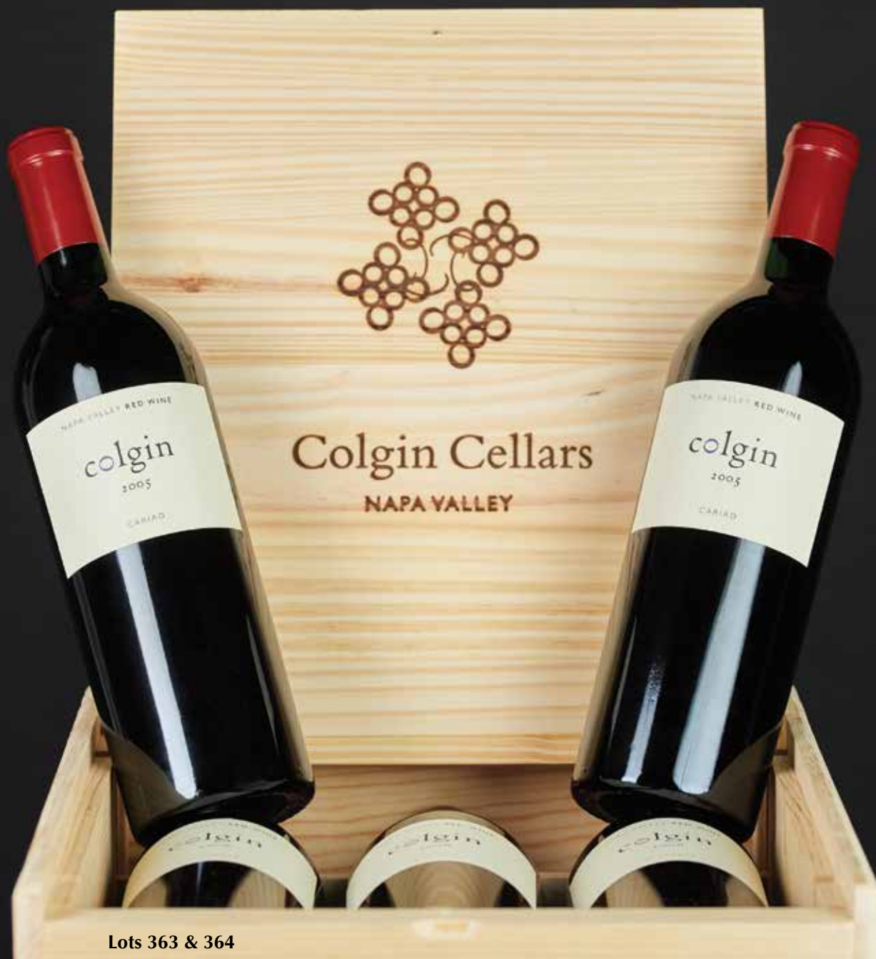
Lots 363 & 364