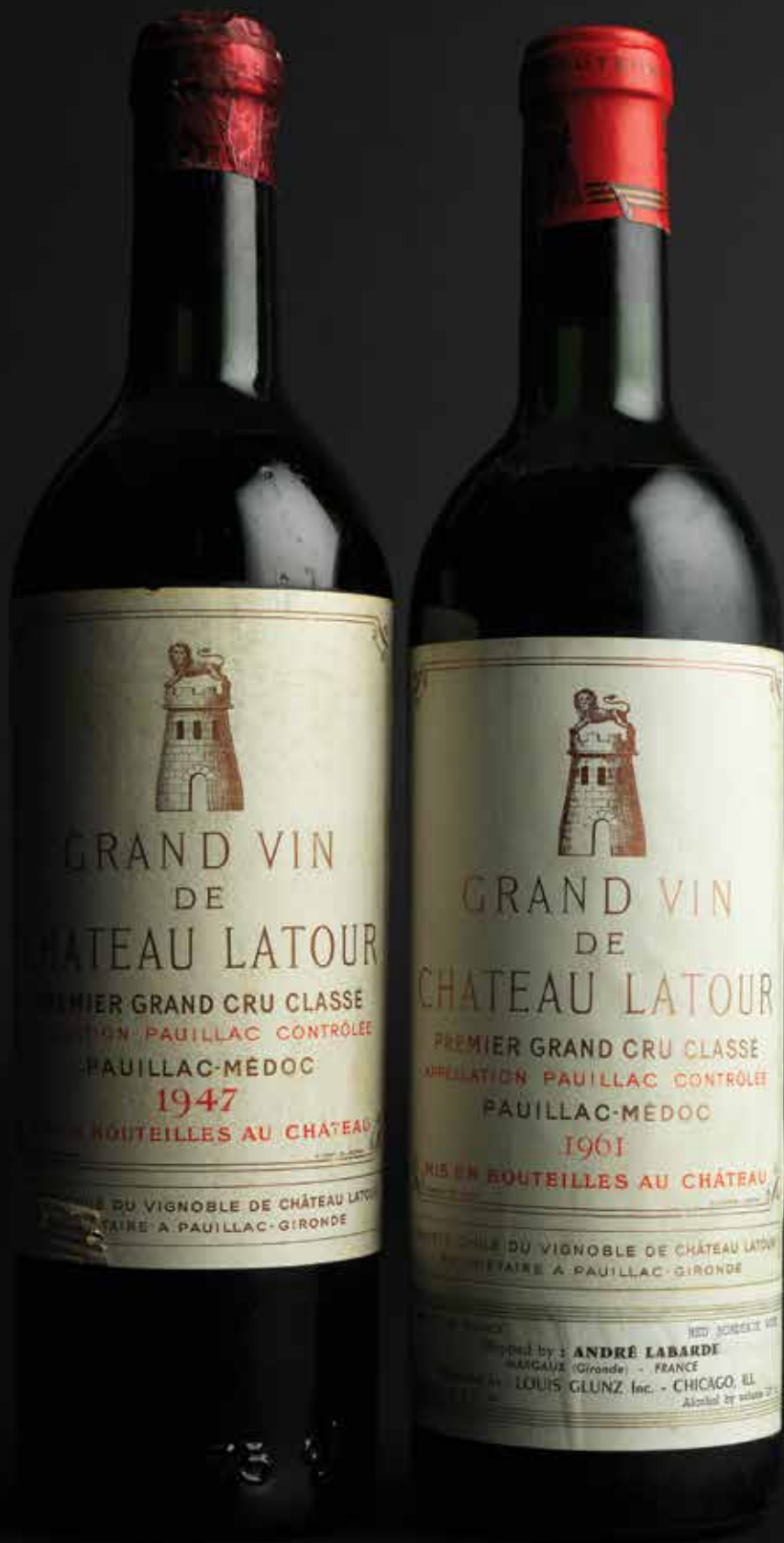
Lots 30, 33 & 34