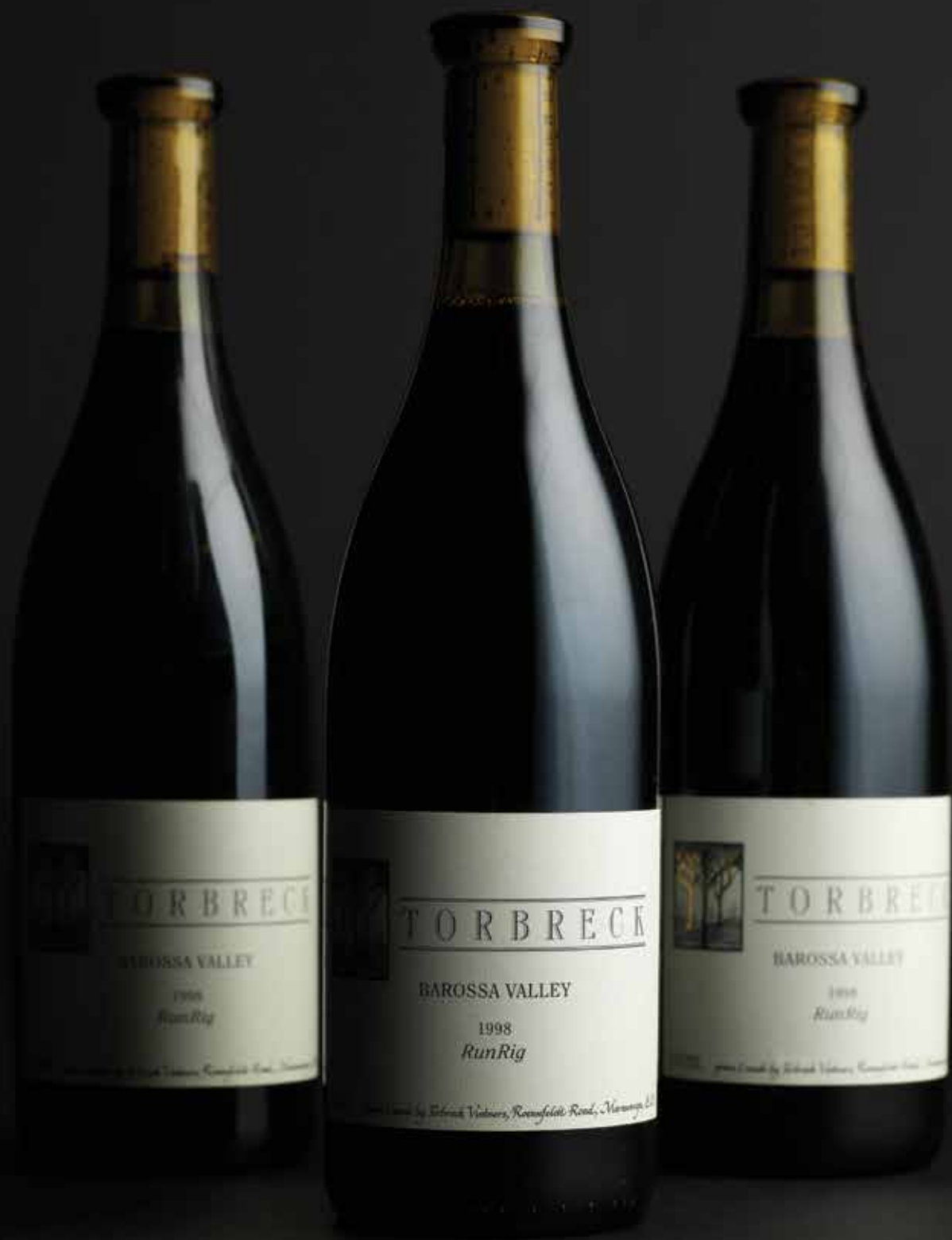
Lots 910 & 911