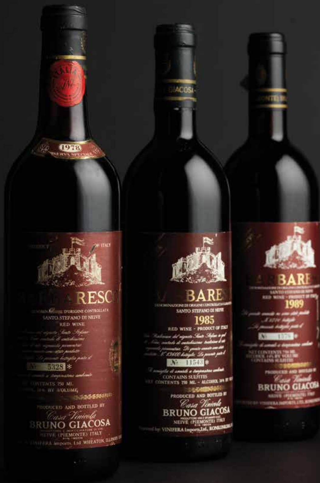
Lots 679, 689, 690, 694 & 695