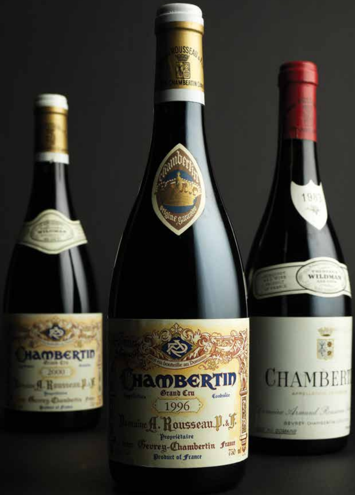
Lots 405, 406 & 408