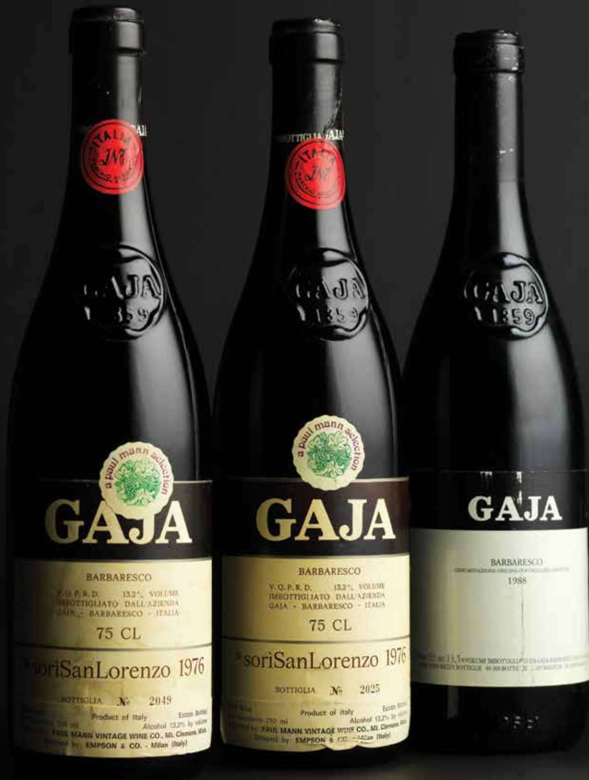
Lots 639 & 643