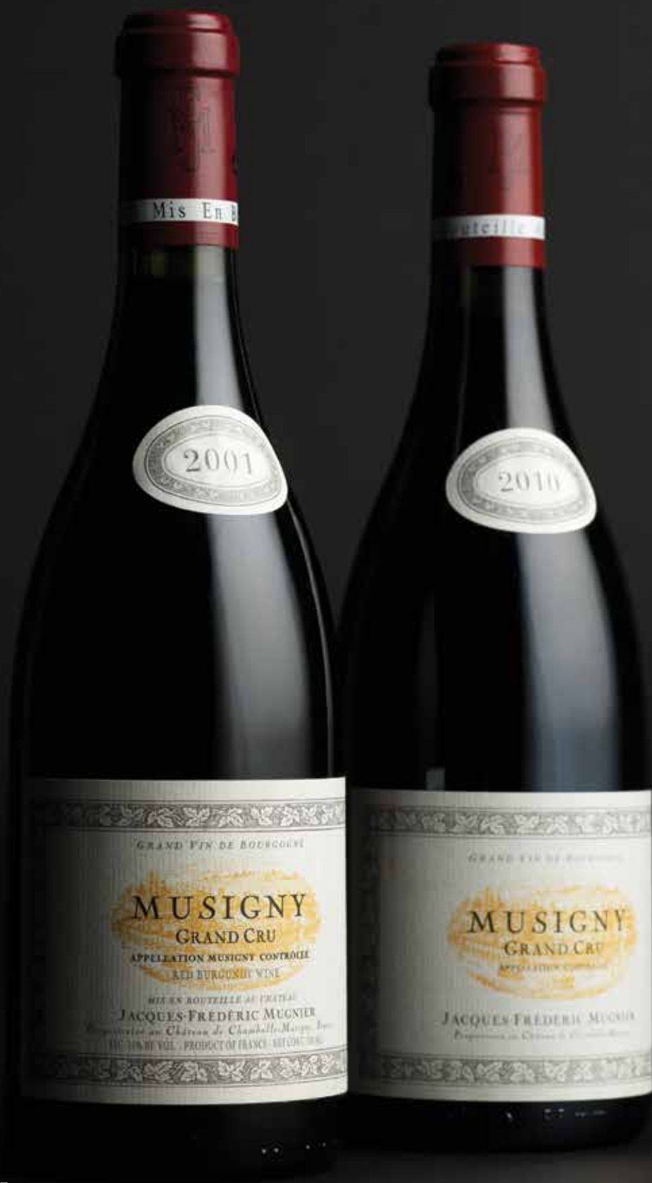
Lots 351 & 355