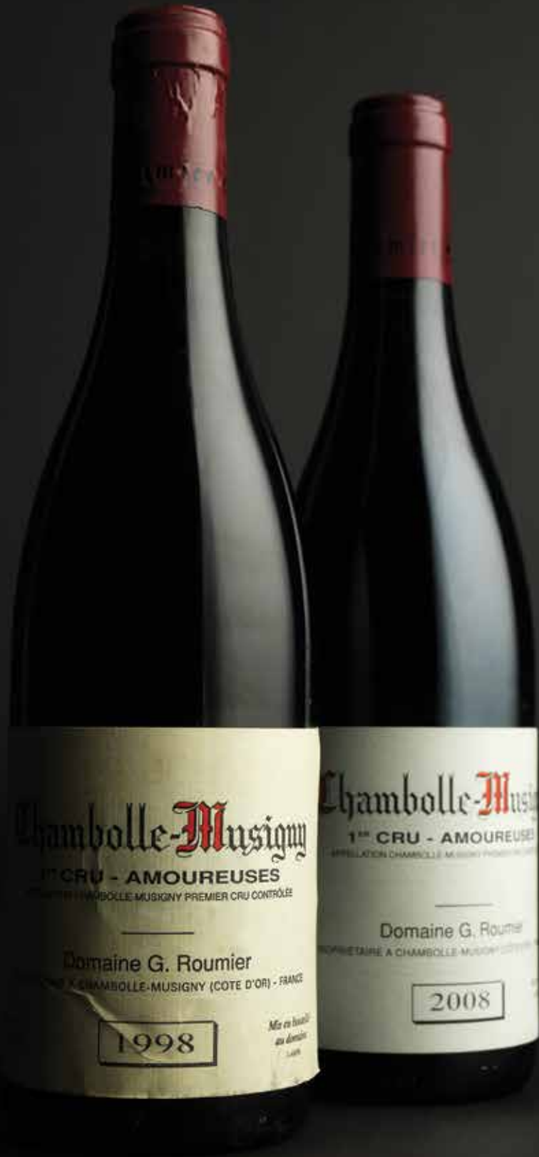
Lots 391 & 393