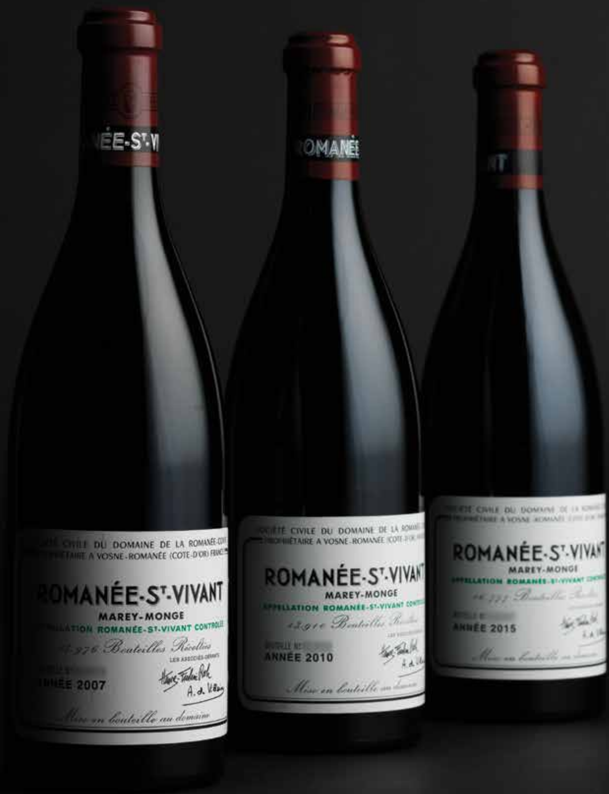
Lots 119, 122 & 125