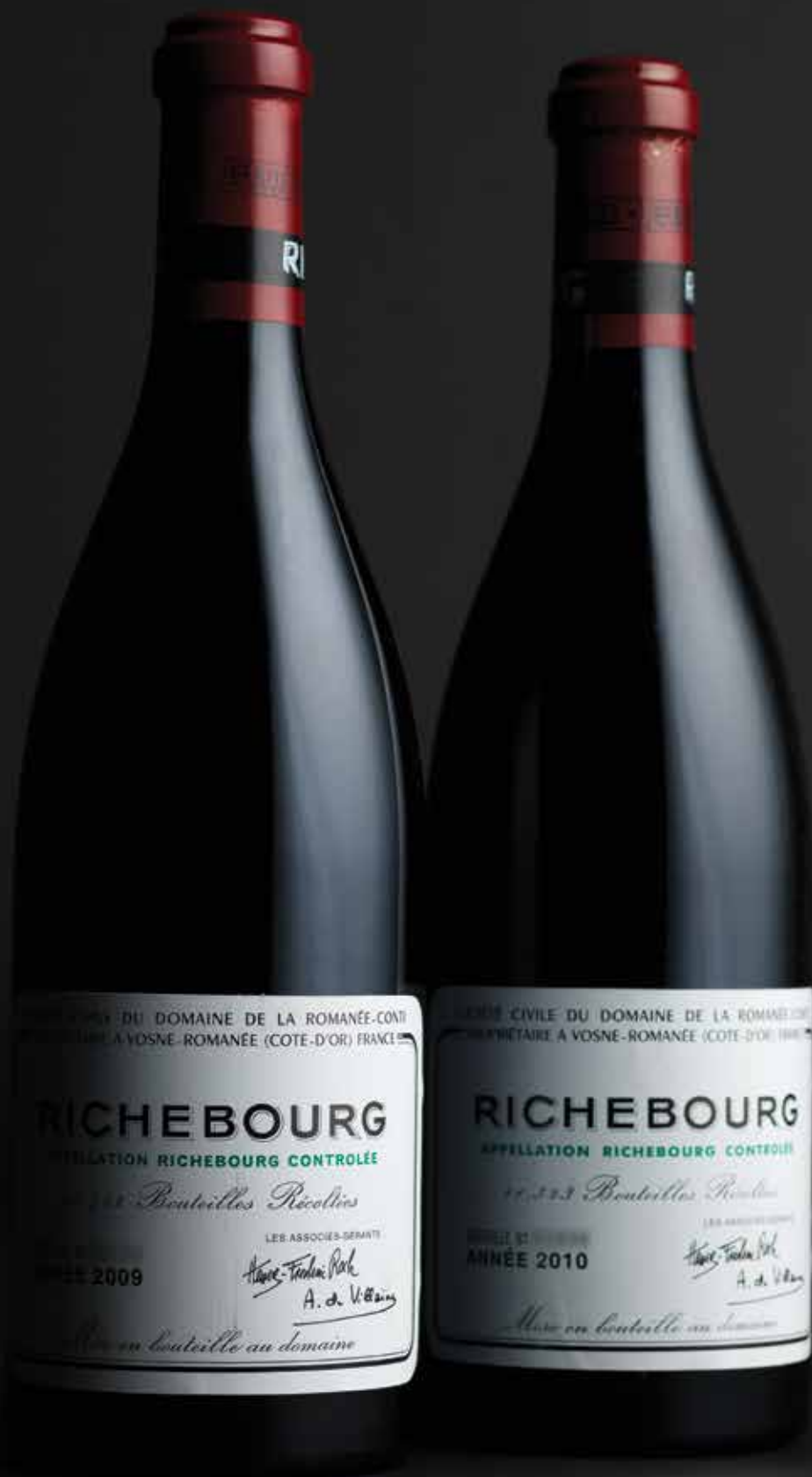
Lots 110 & 111